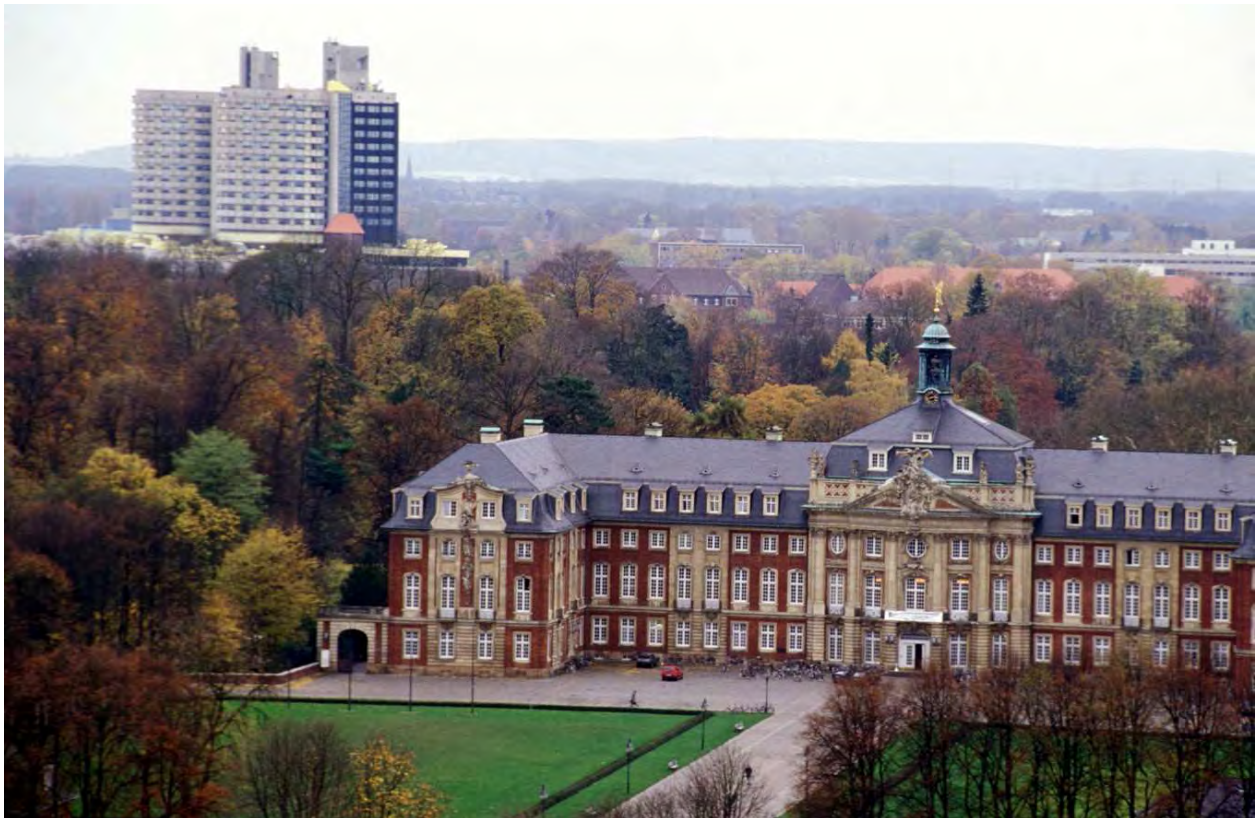
University Hospital and Chateau Muenster

Arranged by the International Breast Ultrasound School (IBUS) in co-operation with the Reference Centre for Mammography, University of Muenster, Germany